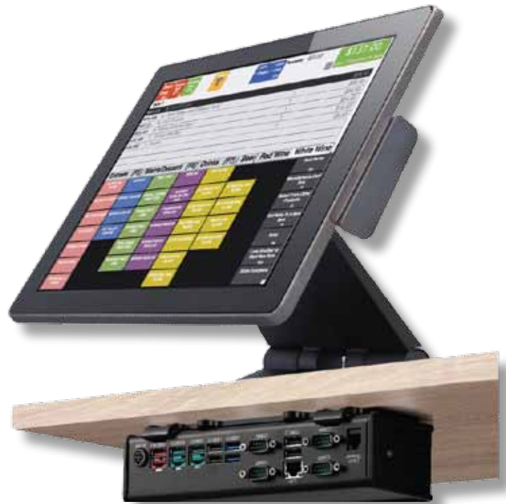
The external ports module can be easily installed under the counter with the included bracket (Shown with optional powered USB ports).