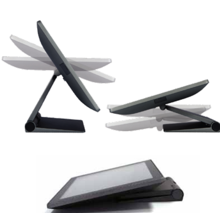
The sturdy flexible stand offers a wide variety of usable positions, up to complete closure for easy transport.