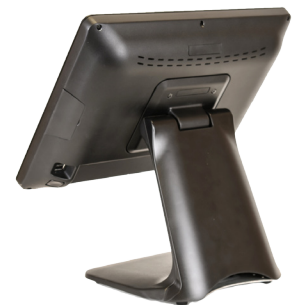
Slim and sleek design, complete casing in die-cast aluminum